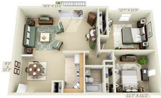
2BR Deluxe (Plan C) • 1130 sf