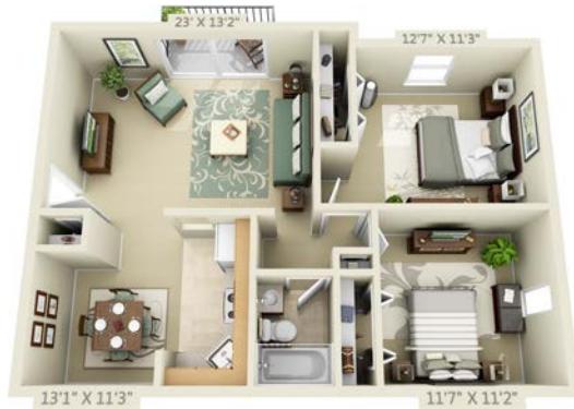
2BR (Plan B) • 960 sf