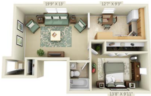
1BR (Plan A) • 830 sf